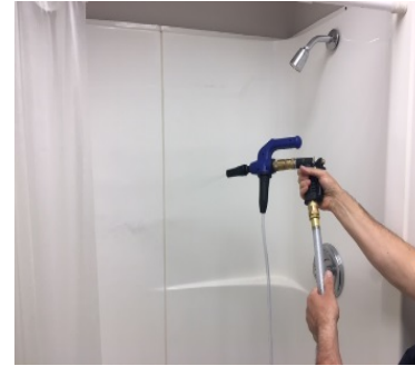
CLEAN with MSC (Blue)