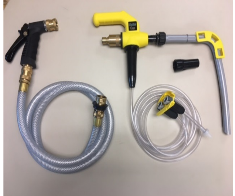
p/n AT20048 DISINFECT with MM (Yellow)