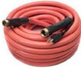
CONNECT to water supply