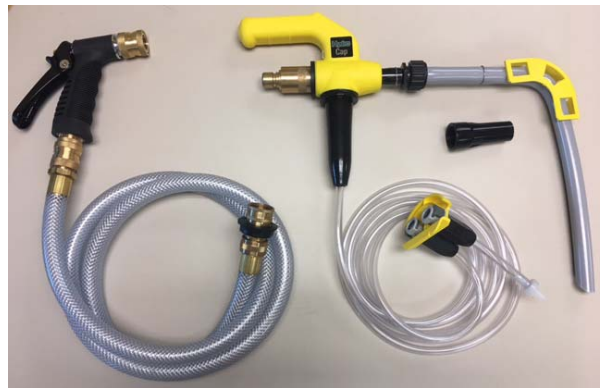
AT20048 – Orbio os3 PDU – MultiMicro (Yellow)