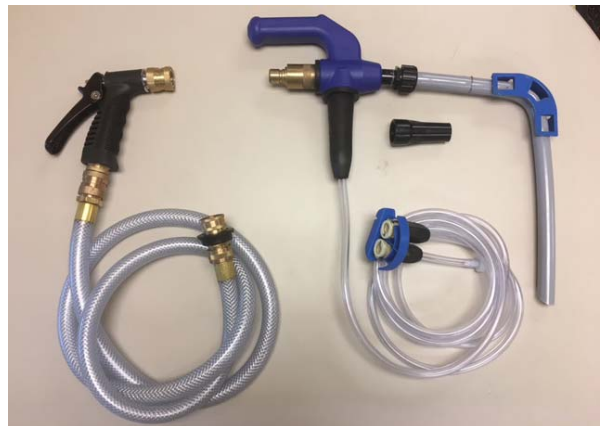
AT20049 – Orbio os3 PDU – MultiSurface Cleaner (Blue)