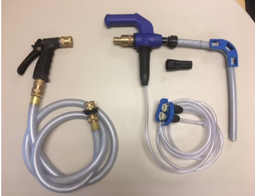
p/n AT20049 CLEAN with MSC (Blue)