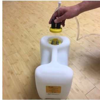
CONNECT to Concentrate