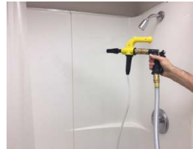
DISINFECT with MM (Yellow)