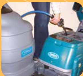
Fill automated cleaning machines