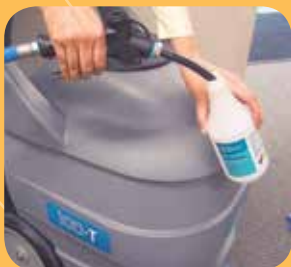
Fill spray bottles