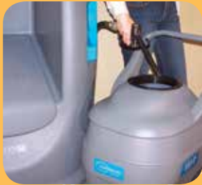
Fill transport carts from Orbio® machines