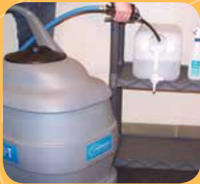
Refill remote solution containers