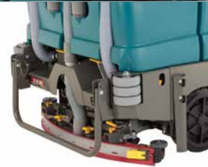
Dura-Track™ Parabolic Squeegee