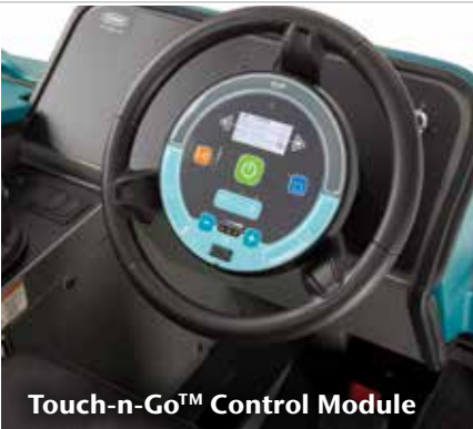
Touch-n-Go™ Control Module