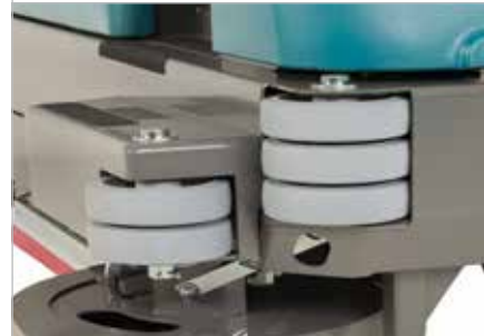
Heavy-duty Frame and Cushioned Corner Rollers

Overhead guard protects operators from falling objects.