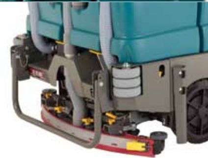
Dura-Track™ Parabolic Squeegee