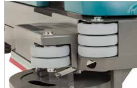
Heavy-duty Frame and Cushioned Corner Rollers

Overhead guard protects operators from falling objects.