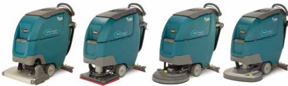
Dual Cylindrical: 20 in / 500 mm

The T300 scrubbers have multiple machine head types to fit your cleaning applications and optimize cleaning performance for specific areas.