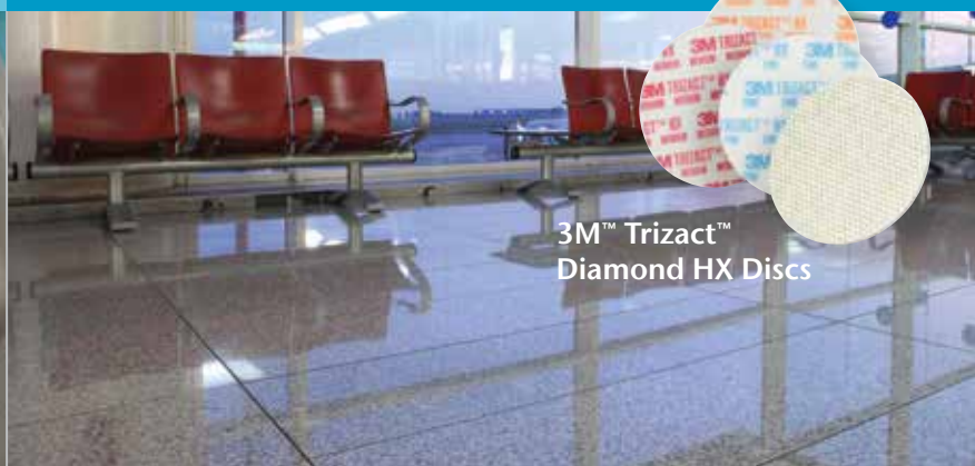
3M™ Trizact™ Diamond HX Discs