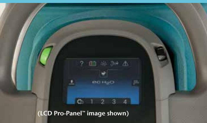
(LCD Pro-Panel™ image shown)

The T300 along with the 3M™ Stone Floor Protection System provides a complete floor care process that restores the natural beauty of your porous stone and produces a remarkable, long-lasting shine.