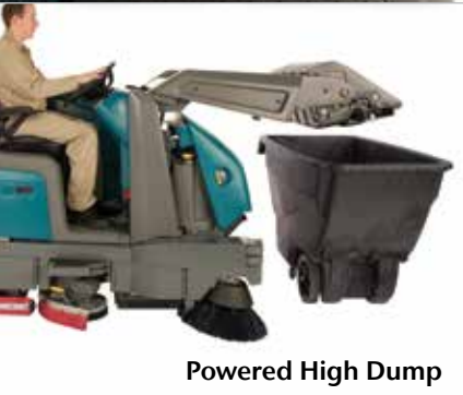
Powered High Dump