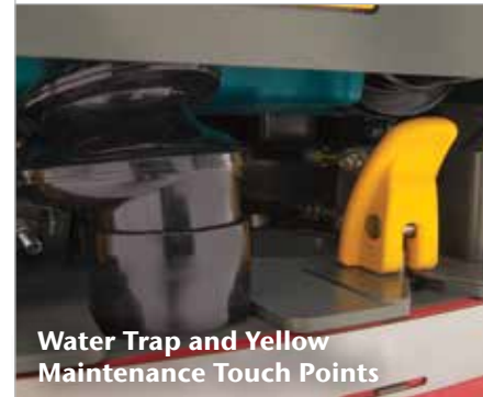
Water Trap and Yellow Maintenance Touch Points

Wet vacuum wand provides convenient and quick off-aisle spill recovery.