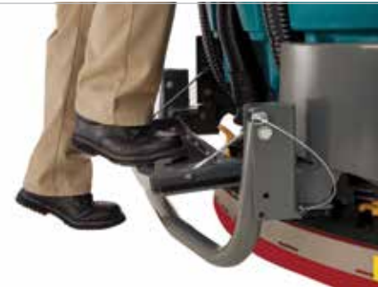
Recovery Tank Access Step