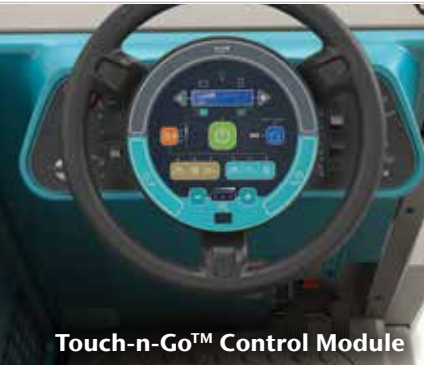
Touch-n-Go™ Control Module