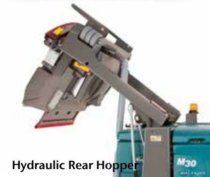
Hydraulic Rear Hopper