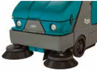
SIDE SWEEPING BRUSH

Increase safety in the most severe environments with an optional overhead guard . Also, a soft side cab can be installed or removed in minutes to adjust to changing weather conditions.