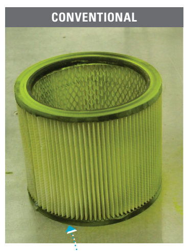
Dust embedded in the filter is harder to clean off and shortens the filter life