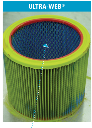
Dust did not penetrate the filter, resulting in longer filter life