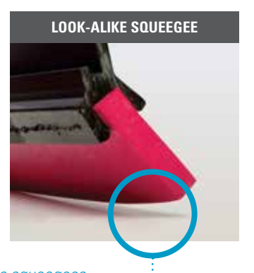
Gaps on look-alike squeegees leave water on the floor due to their exaggerated angle