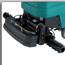
1610 - Brushes for restorative cleaning