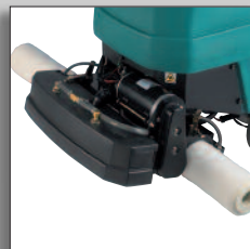
1610 - Rollers for maintenance cleaning