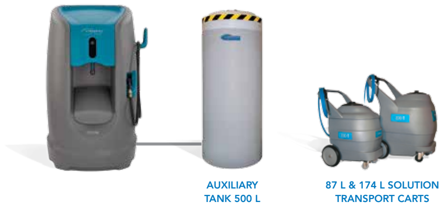
AUXILIARY TANK 500 L

Customise the Orbio® 5000-Sc for your facility and cleaning processes. Auxiliary tanks expand the volume of solution you can store. Solution Transport Carts move a large volume of MultiSurface Cleaner to remote cleaning stations.