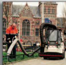
Optional vacuum wand