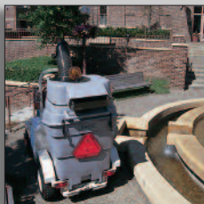
Large capacity hopper