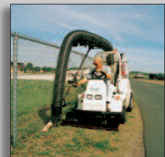
Machine in action