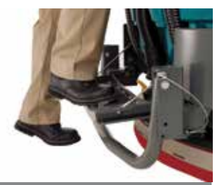
RECOVERY ACCESS STEP

Lower maintenance and repair costs with a heavy-duty front bumper and rear squeegee protection kit that prevents damage to the machine.