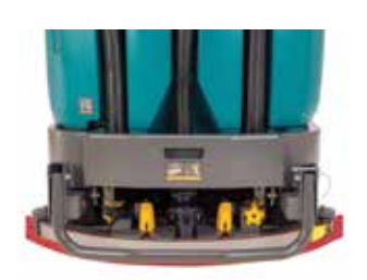
SOLIFEGEE PROTECTION KIT

Simplify training and keep the operator's attention facing forward with the Touch-n-Go™ Control module. The large green 1-Step™ Start Button activates the scrubbing systems and engages the most recent operating setting.