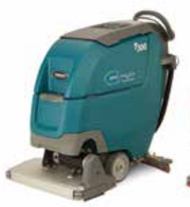
Dual Cylindrical: 20 in / 500 mm

The T300 scrubbers have multiple machine head types to fit your cleaning applications and optimize cleaning performance for specific areas.