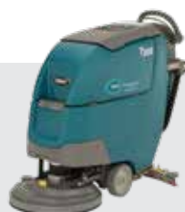
Single disk: 17 in / 430 mm & 20 in / 500 mm

The T300 scrubbers have multiple machine head types to fit your cleaning applications and optimize cleaning performance for specific areas.