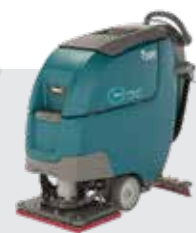
Orbital: 20 in / 500 mm