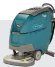
Dual disk: 24 in / 600 mm