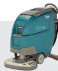
Dual Cylindrical: 20 in / 500 mm