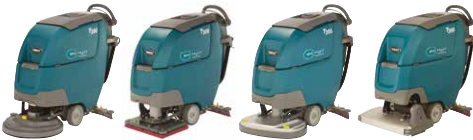
Single disk: 430 mm & 500 mm

The T300 scrubber-dryer provides multiple scrub-decks to fit your cleaning requirements and optimise cleaning performance.