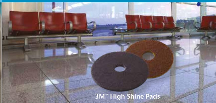
3M™ High Shine Pads