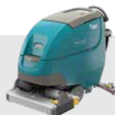
Cylindrical: 28 in / 700 mm

Clean virtually any hard surface condition and maximize your return on investment with a wide range of cleaning heads.