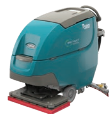
Orbital: 28 in / 700 mm