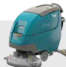
Dual disk: 26 in / 650 mm & 28 in / 700 mm & 32 in / 800 mm