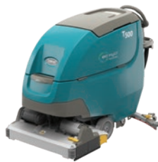
Cylindrical: 28 in / 700 mm

Clean virtually any hard surface condition and maximize your return on investment with a wide range of cleaning heads.