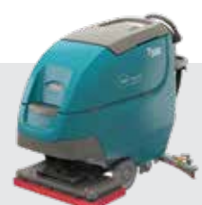
Orbital: 28 in / 700 mm