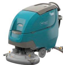
Dual disk: 26 in / 650 mm & 28 in / 700 mm & 32 in / 800 mm