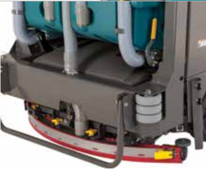
Dura-Track™ Parabolic Squeegee

Overhead guard protects operators from falling objects.