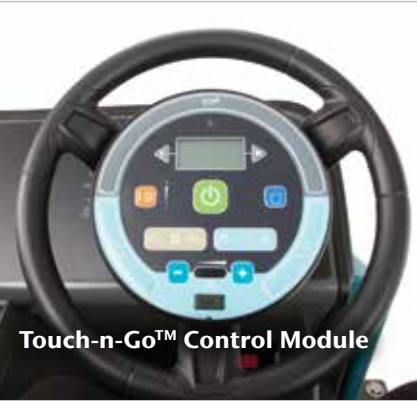
Touch-n-Go™ Control Module

▶ Touch-n-Go™ control module with 1-Step™ start button allows operators quick access to all settings without removing hands from the steering wheel.