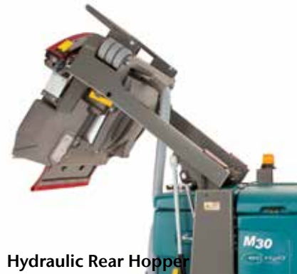
Hydraulic Rear Hopper