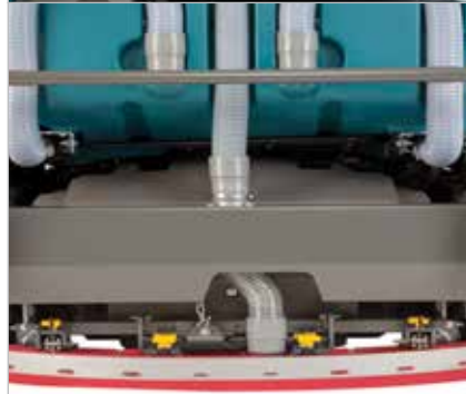
Yellow Maintenance Touch Points