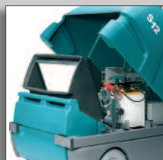
Easy filter change