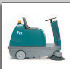
Standard side brush