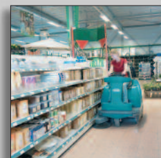
Machine in action