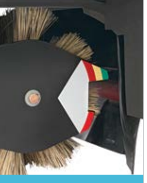
Exclusive color coded brush wear indicator for correct brush position