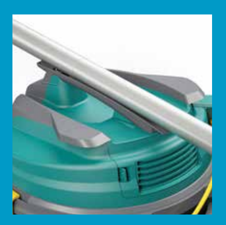
Easy to transport Easily transport by holding the wand with the machine lid.