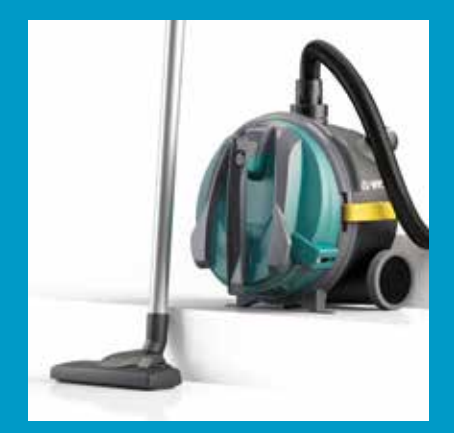
Multiple parking positions Designed for ease of use in small areas and on stairs.